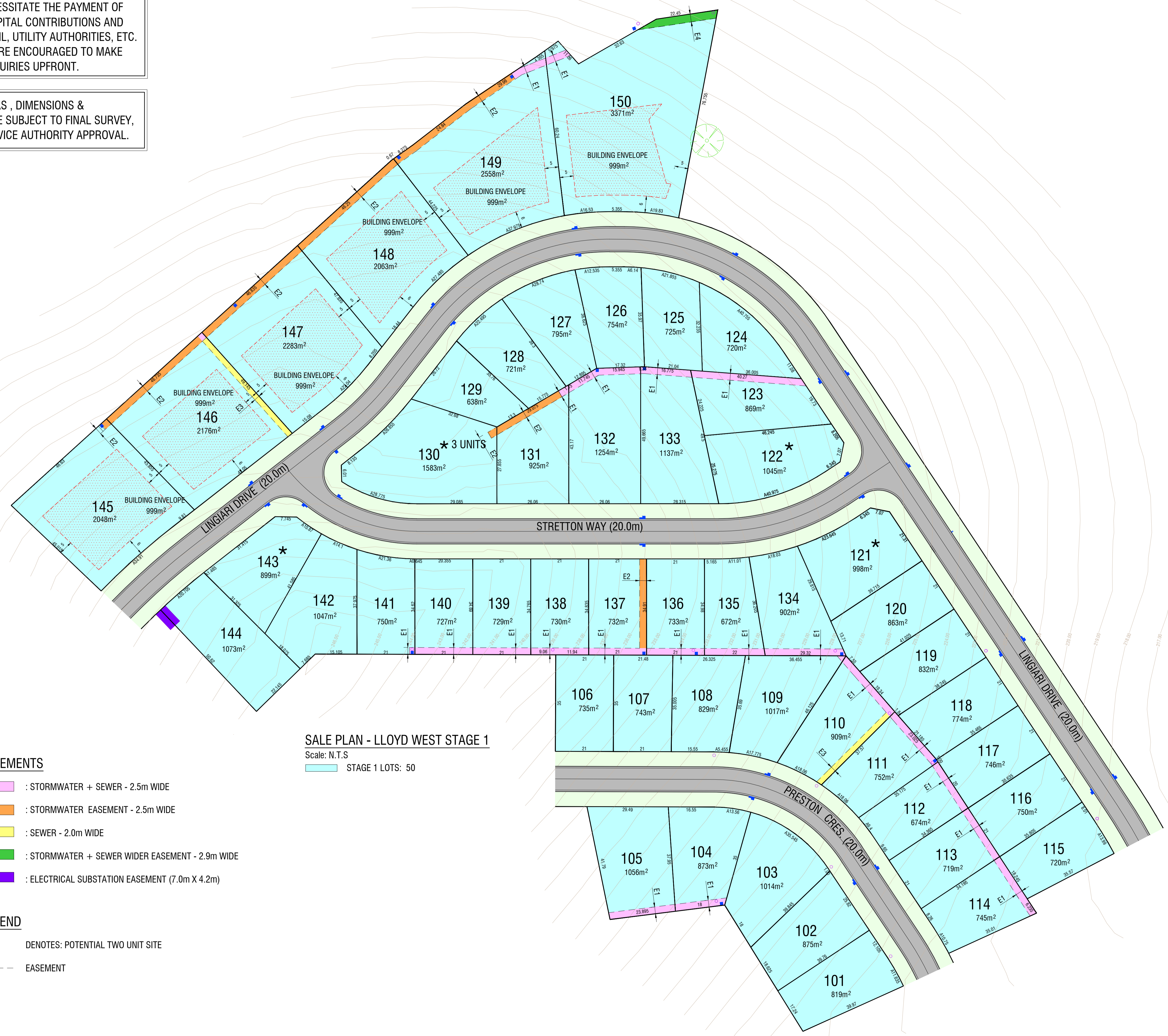
SALE PLAN - LLOYD WEST STAGE 1 Scale: N.T.S STAGE 1 LOTS: 50

NOTE: LOT AREAS, DIMENSIONS & EASEMENTS ARE SUBJECT TO FINAL SURVEY, COUNCIL & SERVICE AUTHORITY APPROVAL.