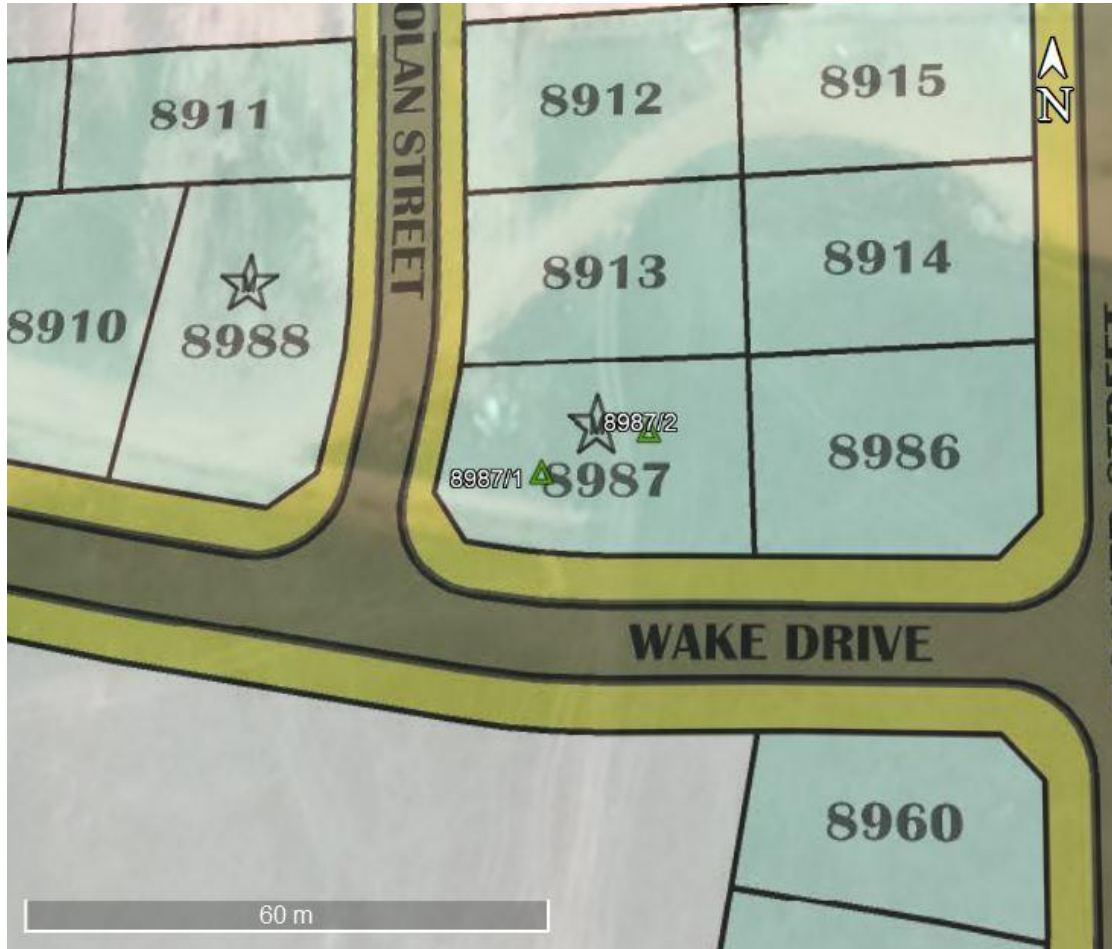
Figure 1: Annotated site plan overlain on aerial photograph depicting borehole locations