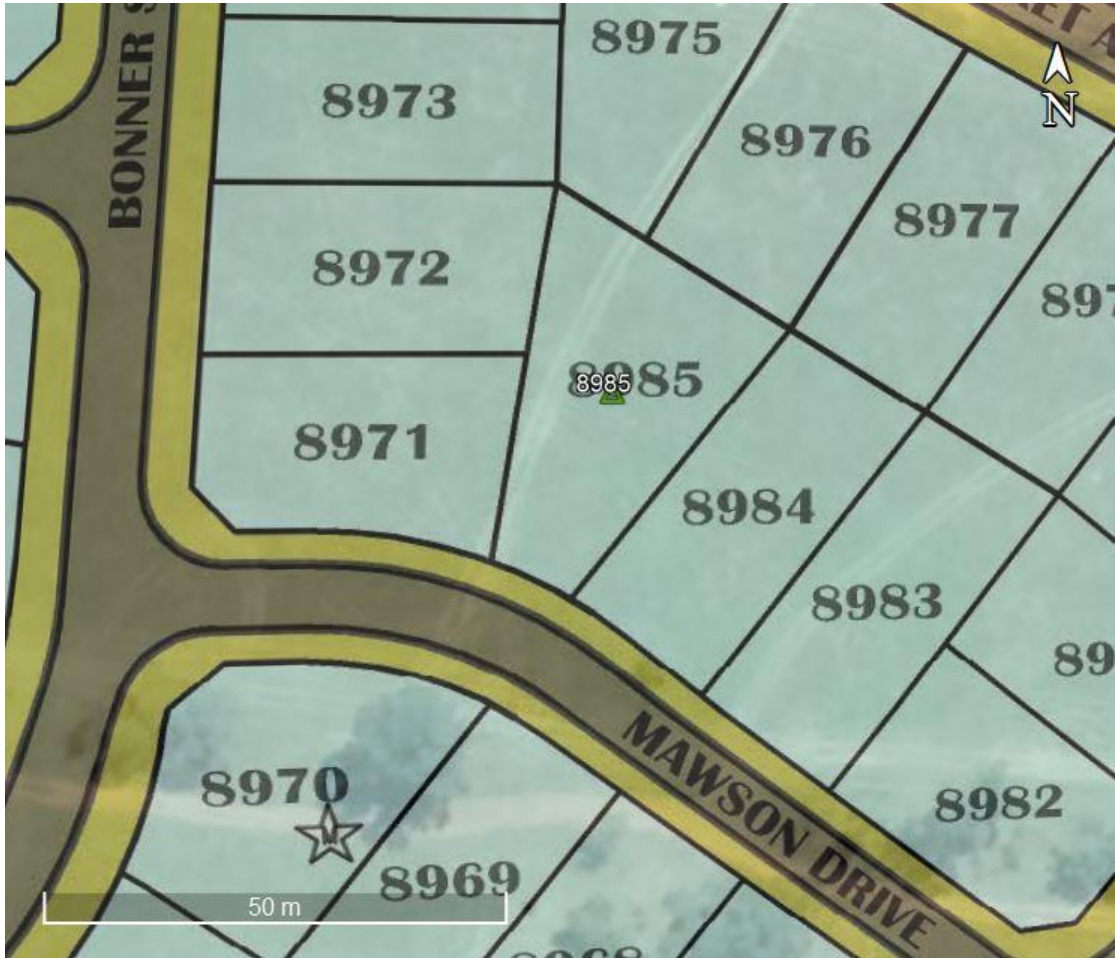
Figure 1: Annotated site plan overlain on aerial photograph depicting borehole locations