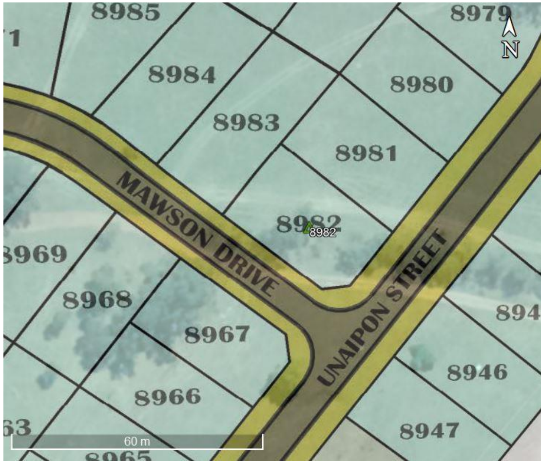
Figure 1: Annotated site plan overlain on aerial photograph depicting borehole locations