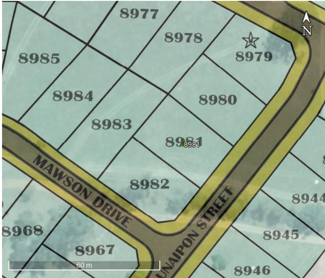
Figure 1: Annotated site plan overlain on aerial photograph depicting borehole locations