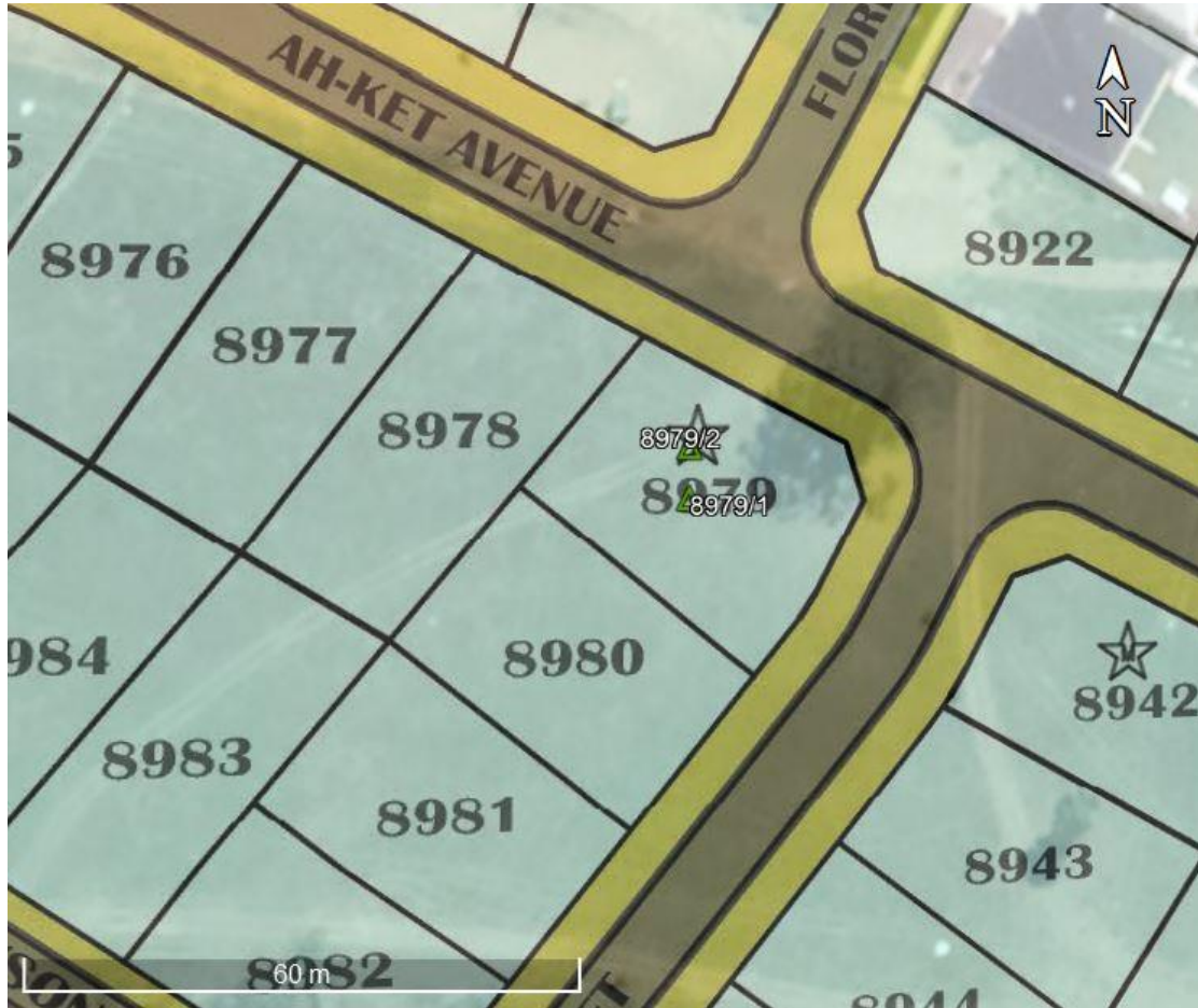
Figure 1: Annotated site plan overlain on aerial photograph depicting borehole locations