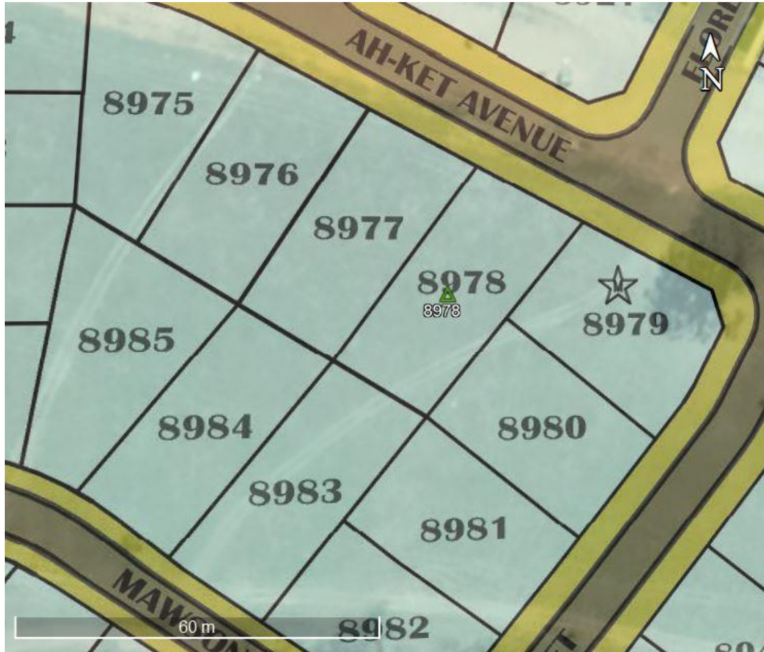
Figure 1: Annotated site plan overlain on aerial photograph depicting borehole locations