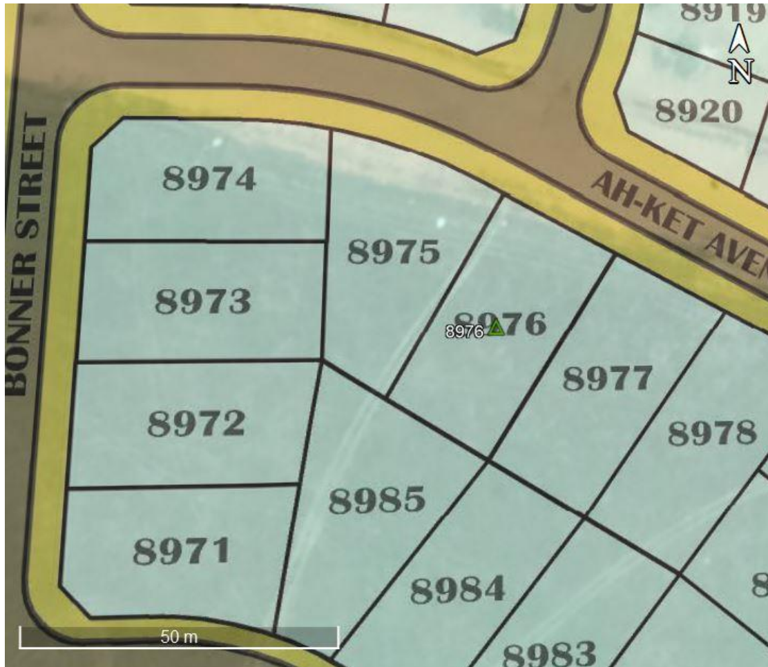
Figure 1: Annotated site plan overlain on aerial photograph depicting borehole locations