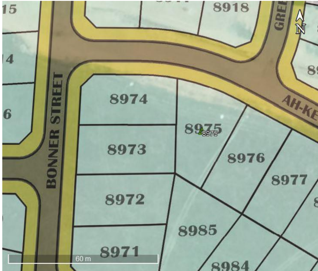
Figure 1: Annotated site plan overlain on aerial photograph depicting borehole locations