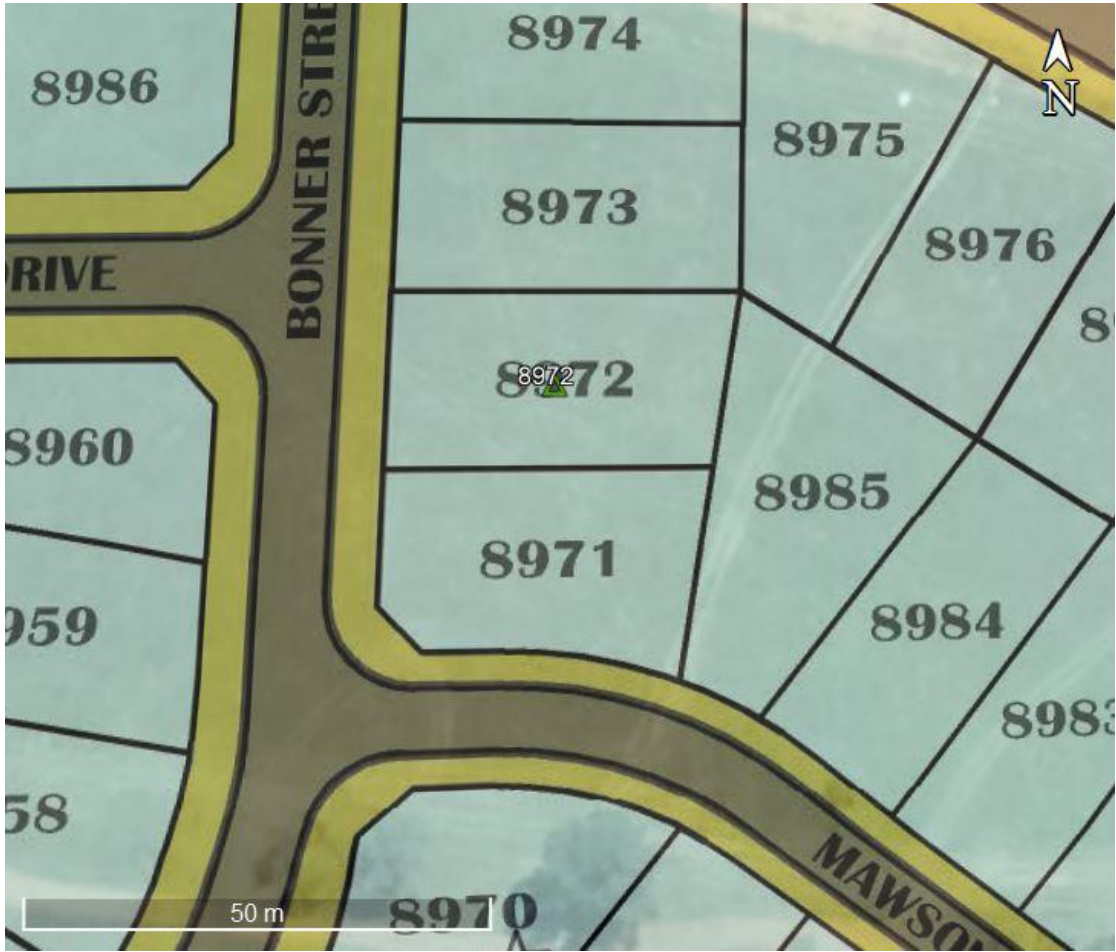
Figure 1: Annotated site plan overlain on aerial photograph depicting borehole locations