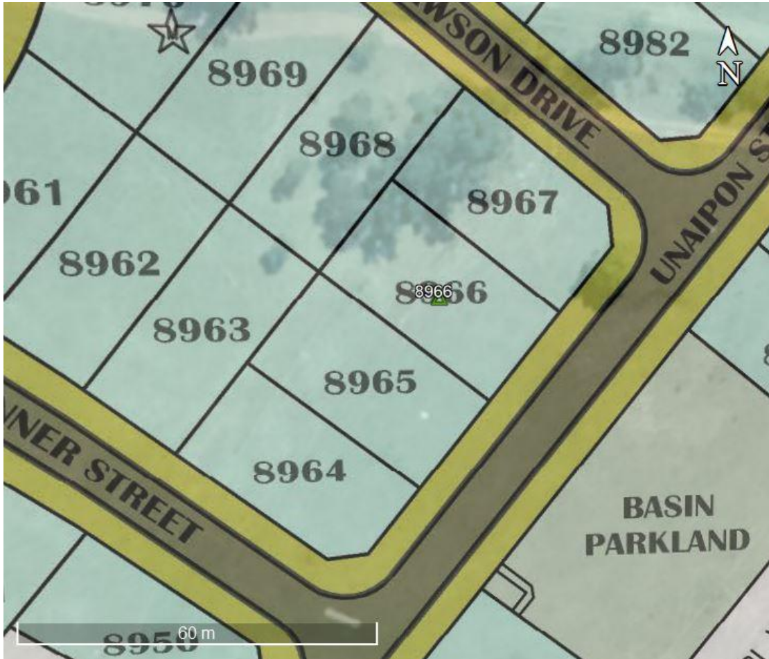
Figure 1: Annotated site plan overlain on aerial photograph depicting borehole locations