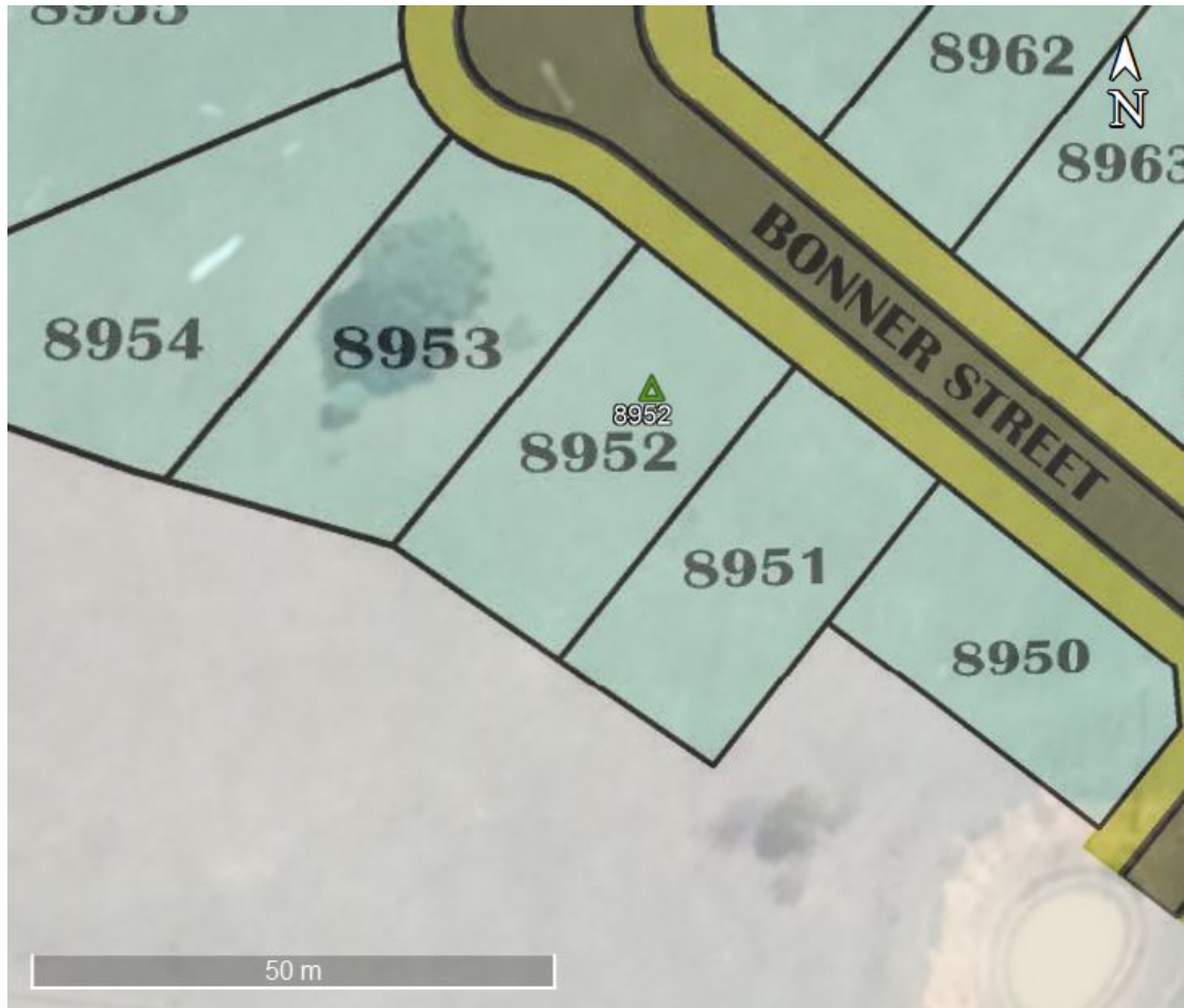
Figure 1: Annotated site plan overlain on aerial photograph depicting borehole locations