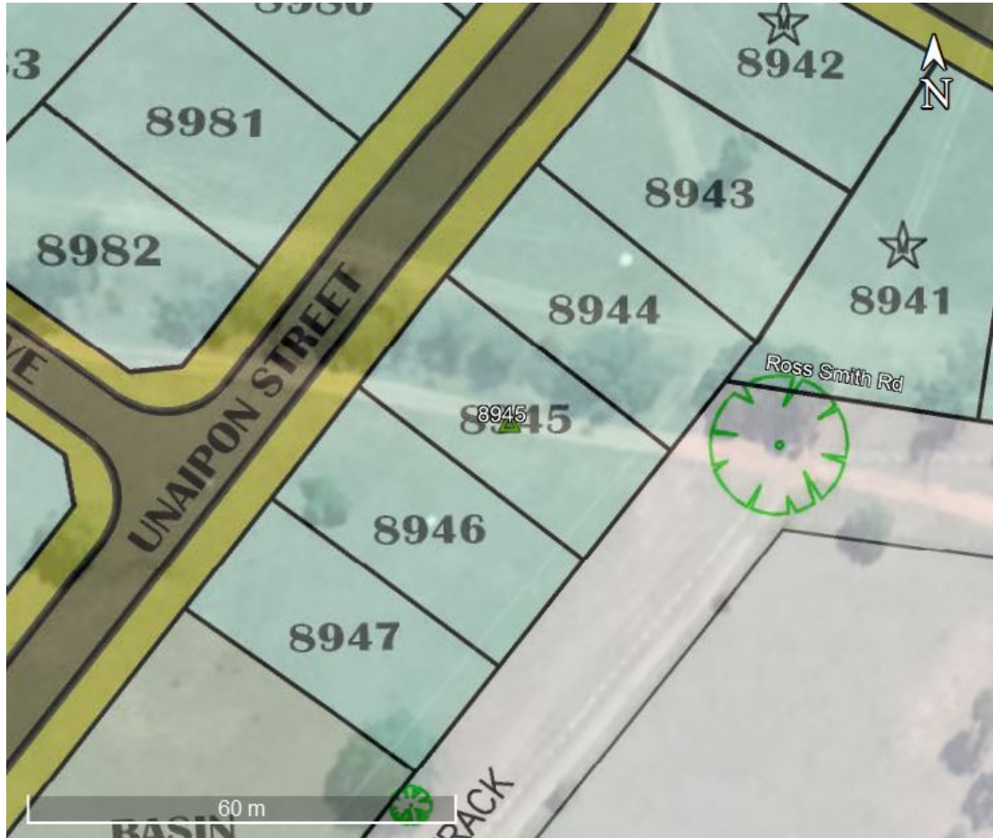
Figure 1: Annotated site plan overlain on aerial photograph depicting borehole locations