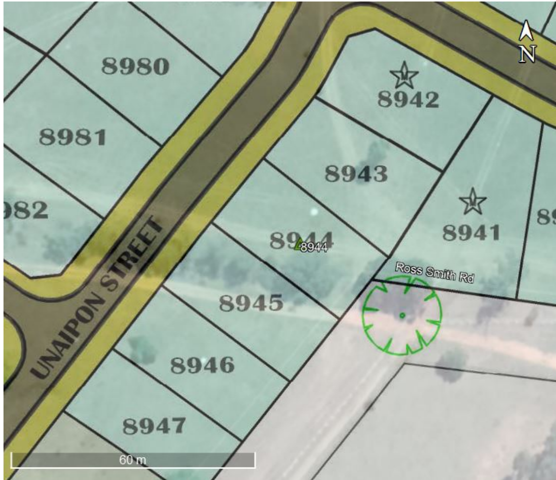
Figure 1: Annotated site plan overlain on aerial photograph depicting borehole locations