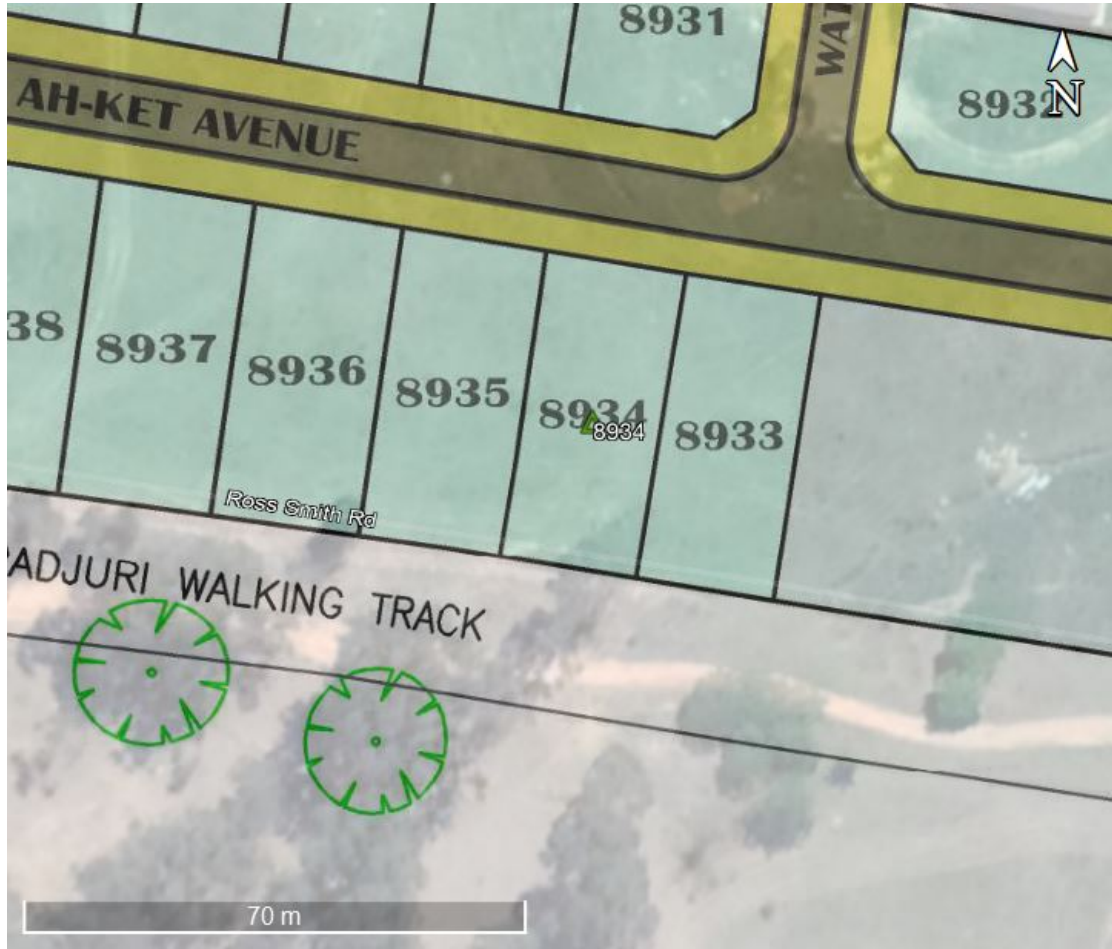
Figure 1: Annotated site plan overlain on aerial photograph depicting borehole locations