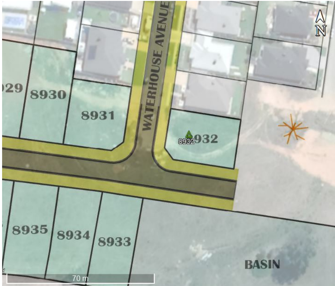
Figure 1: Annotated site plan overlain on aerial photograph depicting borehole locations