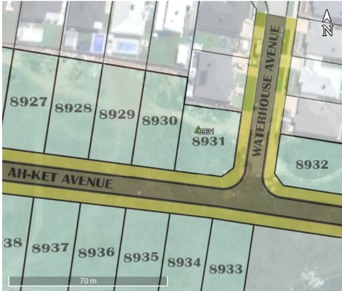
Figure 1: Annotated site plan overlain on aerial photograph depicting borehole locations