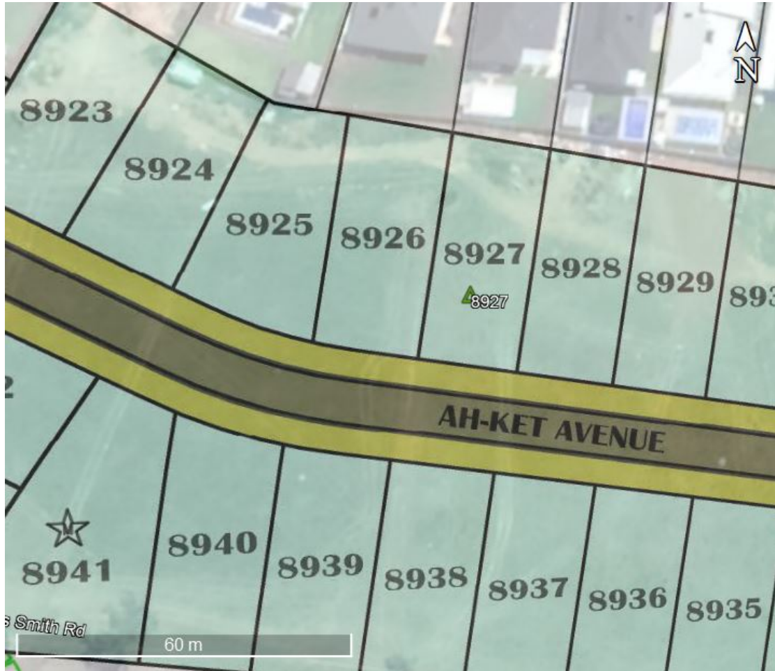
Figure 1: Annotated site plan overlain on aerial photograph depicting borehole locations