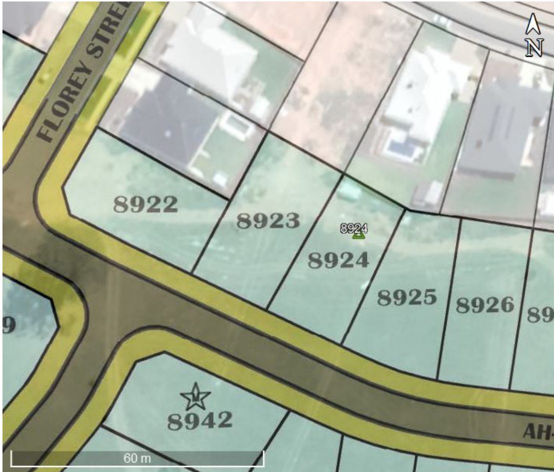
Figure 1: Annotated site plan overlain on aerial photograph depicting borehole locations