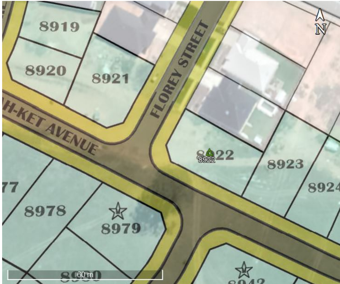
Figure 1: Annotated site plan overlain on aerial photograph depicting borehole locations